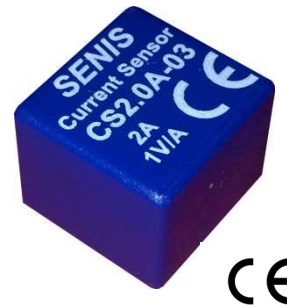
Figure 1. Photo of the CS series current sensor